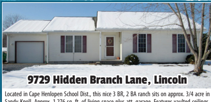
9729 Hidden Branch Lane, Lincoln