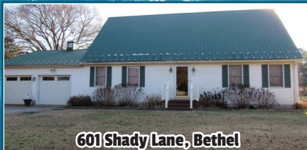
601 Shady Lane, Bethel

CALLAWAY, FARNELL AND MOORE | (302) 629-4514