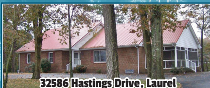
32586 Hastings Drive, Laurel

CALLAWAY, FARNELL AND MOORE | (302) 629-4514