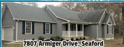
7807 Armiger Drive, Seaford

3 BR, 2 BA ranch home with vaulted ceilings throughout, spacious closets & dual sinks in both BAs. 2 car attached garage & spacious lot with no HOA complete the package. Move-in ready. $225,900. MLS #7255374 Directions: From Rt. 13N, turn right at Royal Farms onto E. High Street. Turn left onto Seaford Rd., then turn right onto River Rd. Continue approx. 1 mile to Hill-n-Dale on left. Keep straight, turn right onto Armiger Dr. Proceed approx. 1 mile, last house on left. Hostess: Shannon Payton (302) 228-8583 (Cell)